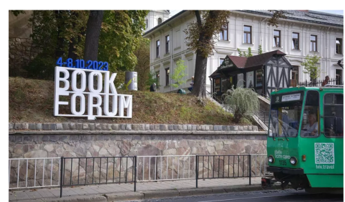
Lviv ha acogido en los últimos días una nueva edición de su BookForum.