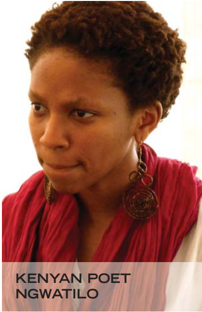
KENYAN POET NGWATILO