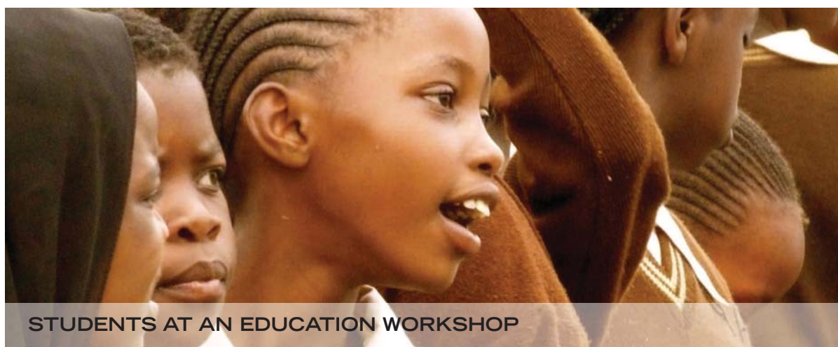
STUDENTS AT AN EDUCATION WORKSHOP

The StoryHippo Village was the joyful heart of the festival, full of colour, creativity and laughter.