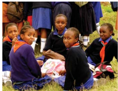
IN BETWEEN EVENTS