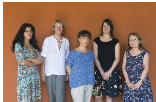
2017 Colombia-France year guests