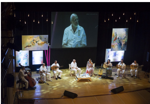
Musical homage: El bambuco pide playa