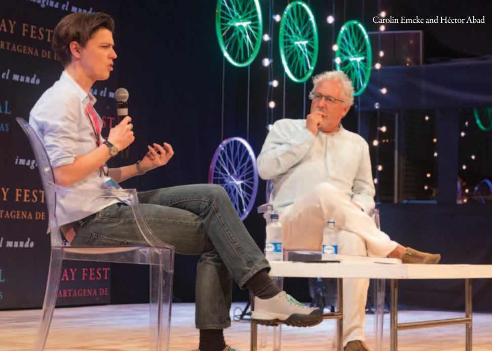
Carolin Emcke and Héctor Abad