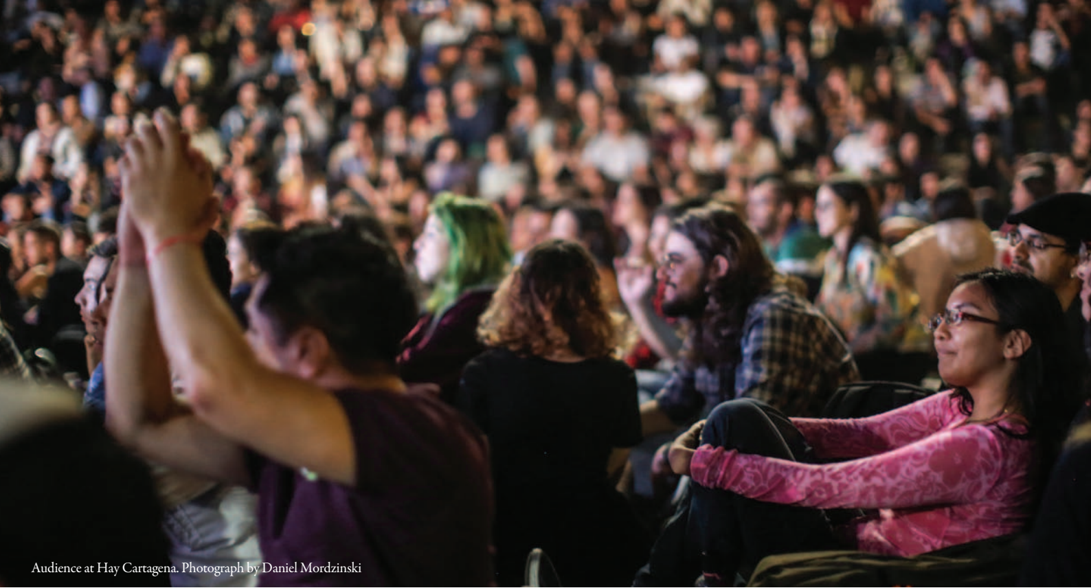
Audience at Hay Cartagena.

Hay Festival celebrated the Bogotá39-2017 : a selection of the best fiction writers under 40 from across Latin America aiming to promote good literature by highlighting literary variety and talent in the region. In order to disseminate their works, it was decided to work with 14 independent publishing houses . In addition, the Bogotá39-2017 have been showcased in a new anthology of work, published in both Spanish and English.