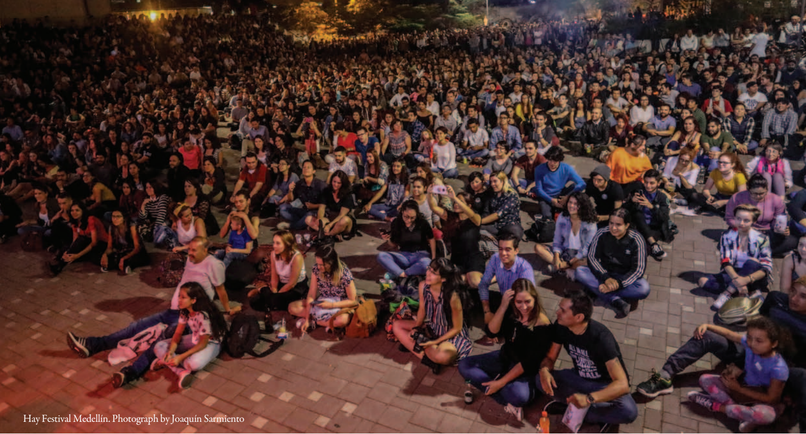
Hay Festival Medellín.