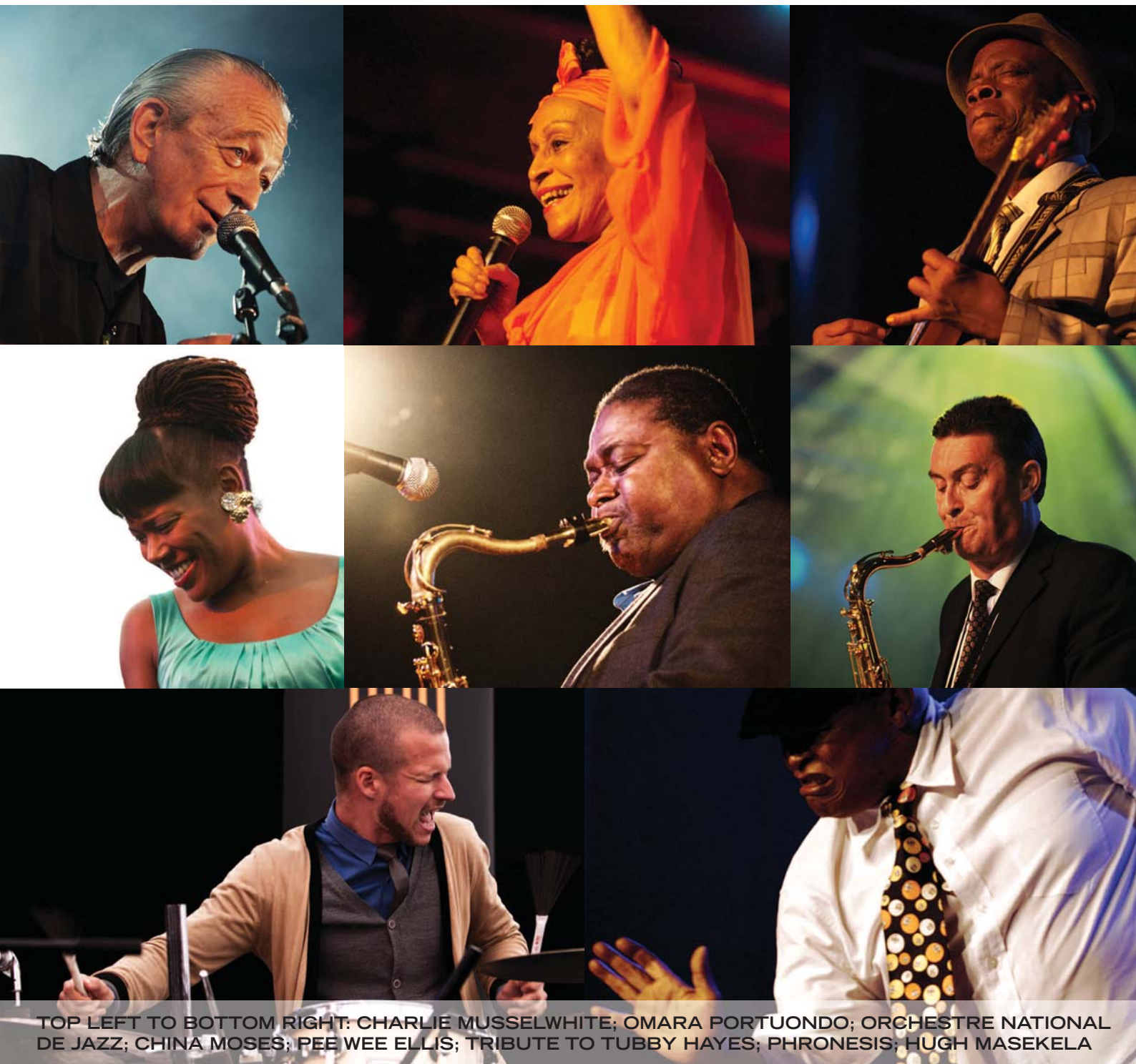
TOP LEFT TO BOTTOM RIGHT: CHARLIE MUSSELWHITE; OMARA PORTUONDO; ORCHESTRE NATIONAL DE JAZZ; CHINA MOSES; PEE WEE ELLIS; TRIBUTE TO TUBBY HAYES; PHRONESIS; HUGH MASEKELA