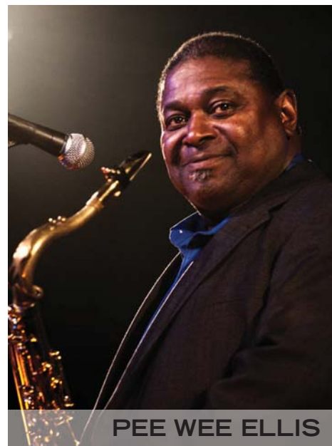
PEE WEE ELLIS