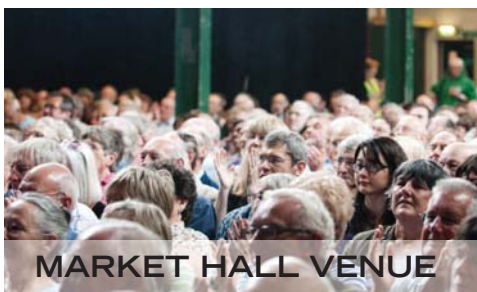
MARKET HALL VENUE

“RESCUED BY THE HAY FESTIVAL, and this year augmented by a jam-packed Fringe programme, the Brecon Jazz Festival is now in rude health.”